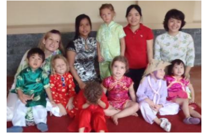
Mid Autumn Moon Festival