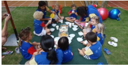
Visit to Smartkids Tran Ngoc Dien