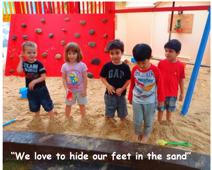
"We love to hide our feet in the sand"