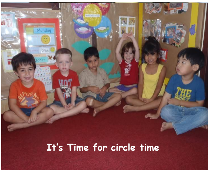
It's Time for circle time