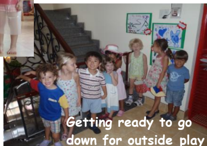
Getting ready to go down for outside play

Notes: We want to inform you that we are combining the Red and Blue groups. The Blue and Red group will be one big group now in the Blue room.