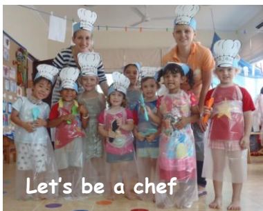
Let's be a chef

Jolly Phonics: We have finished learning the first group of sounds s, a, t, p, i, n. We are now in the second group c/k, e, h, and m. The children loved to repeat letter sounds and sing the songs. They are linking letter sounds and starting to make three letter words.