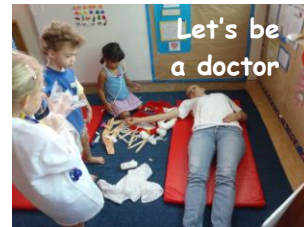
Let's be a doctor