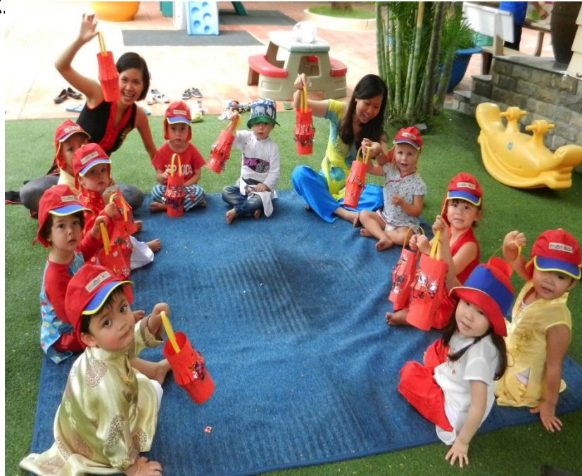
What a fun picnic!