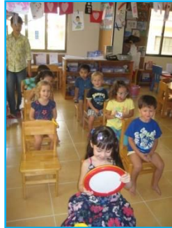
"driving a bus" game in our theme week "drivers" & "missing person" game with Police officers.