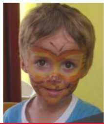
Albert the Lion