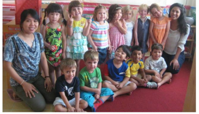
The Red Group 2011-2012