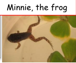
Minnie, the frog