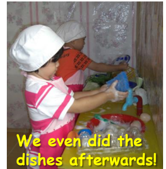
We even did the dishes afterwards!

After Easter, we learned about farmers and cowboys/girls. Yee-hah! We continued with our job theme and focused on people in our neighborhood. The Yellow Group had a restaurant full of chefs chopping and mixing rice, vegetables, beans, and noodles.