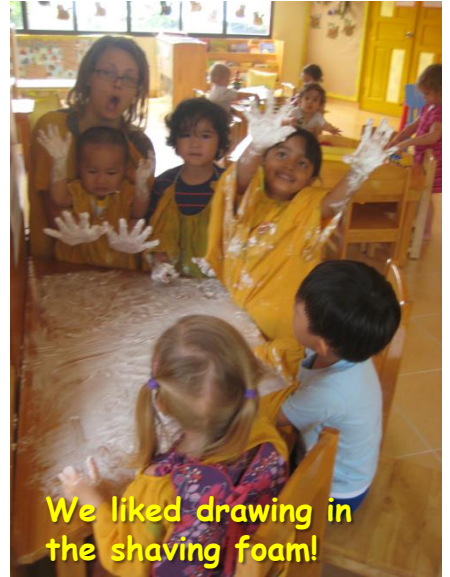
We liked drawing in the shaving foam!