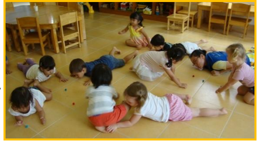
We couldn't touch them with our fingers!

Next, we learned about water and boats, rocks and crystals, and finally fire! We loved reading about firefighters. We also learned that