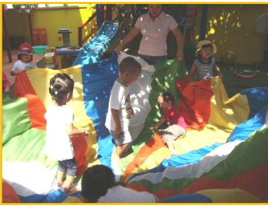
Four little monkeys jumping on a bed!

outside and watched it fall over us. We loved jumping up and down on it and singing our counting songs! We also learned about our breath and blew pompoms across the floor.