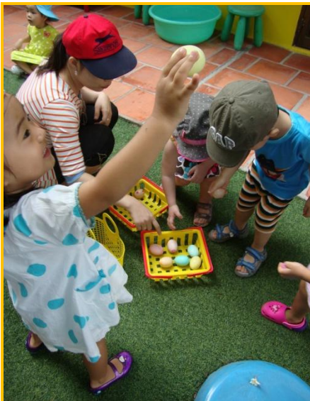
We had real, plastic, and clay eggs that we had to sort!

Then we moved onto Easter. We learned that rabbits move their ears to listen better and hear who or what is coming. We learned a little about the egg and chicken life cycle. Then we dyed duck eggs with food coloring and vinegar. It was quite the smell! The "Easter bunny" took the eggs and hid them all over the place! We had to look inside and out! At snack that day, we ate our individual eggs after cracking and peeling them.