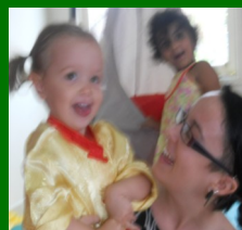
I've had such a wonderful