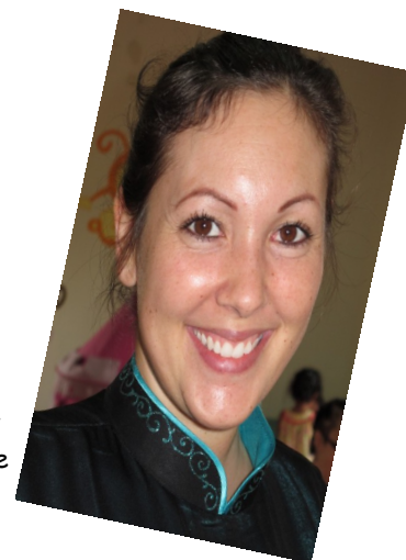
Thank you everyone for a great term!