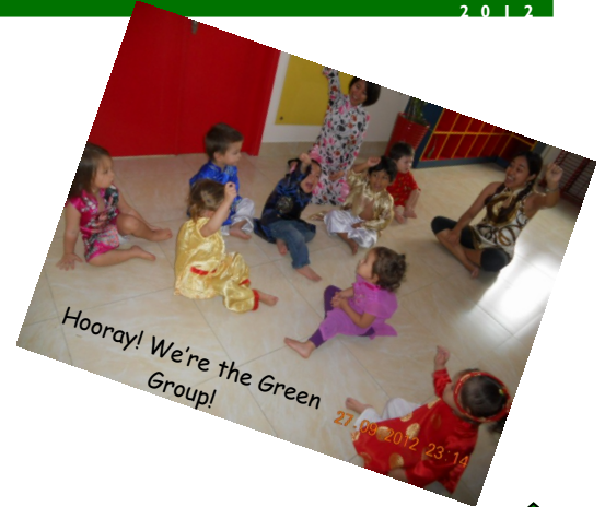
Hooray! We're the Green Group!

This term has been a term full of music and dancing. We've loved learning all about ourselves through movement and songs. Celebrating the Moon