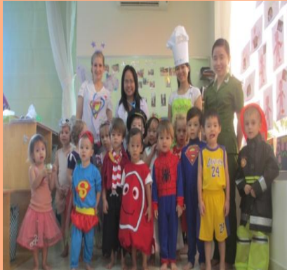
Dress-up Day fun 26/05/2014