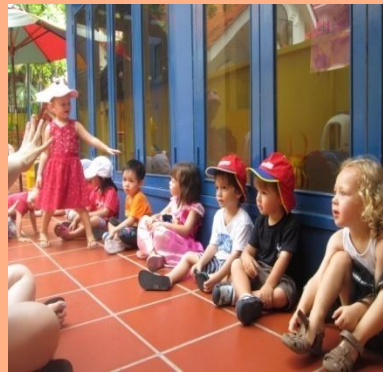
Counting our friends